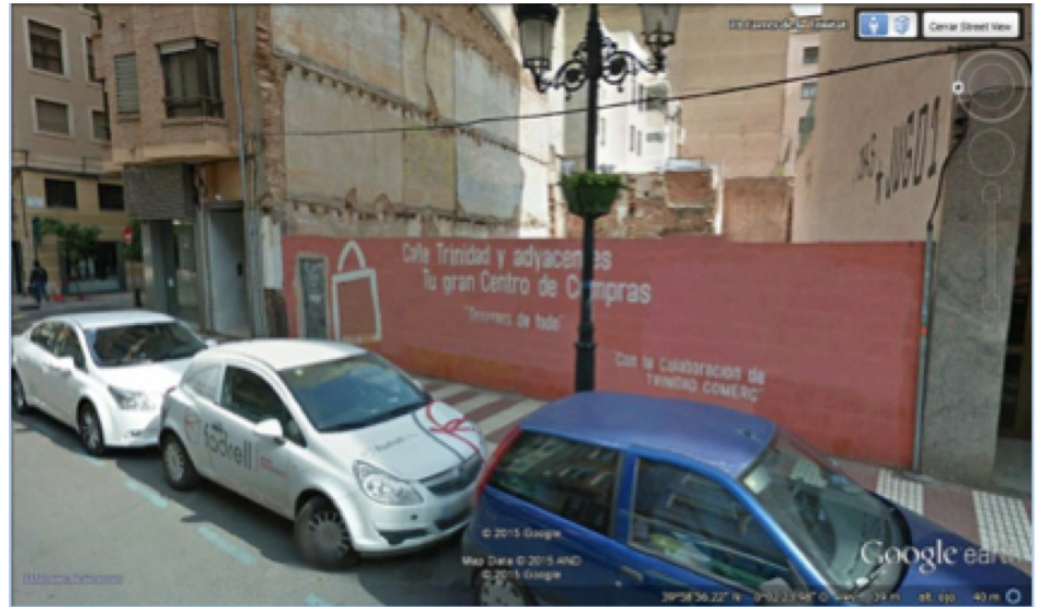
Trinidad Street num 71.- Capacity for several locations and very close to the center.